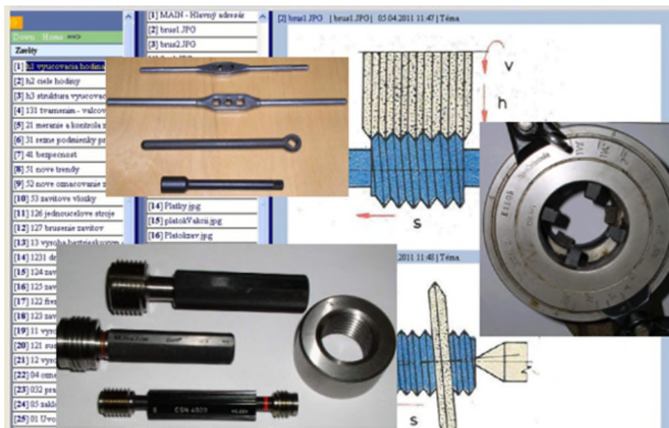
Fig. 1 Screenshot of creating e-Learning by pre-service teacher

A unique didactic output was the cooperation of a teacher with a student who taught her the C ++ programming language. She studied C # the next year, writing notes and source codes in a WPad table so that the teacher could learn another programming language. So this is a really specific case, because she produced e-Learning material for her teacher.